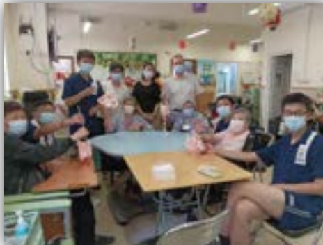
22nd September 2023 Lutheran Social Service Center