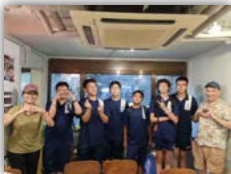
25th August 2023 Mei Ho House

Hooray! Services learning kicked off on 25th August 2023 with the Earth House. We had been to the Mei Ho House at Sham Shui Po, the Crossroads and the Lutheran social service center in quarter 1. Students are introduced to different facets of society and apply their academic knowledge and skills to serve the community while community members benefit from students' voluntary and quality service.