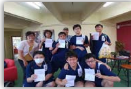
29th September 2023 Crossroads