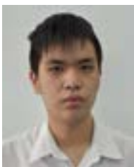
Grade 12 Representative