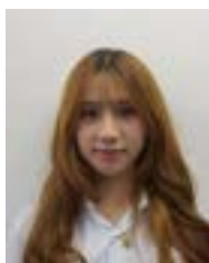
Grade 8 Representative