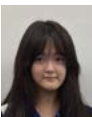
Grade 7 Representative